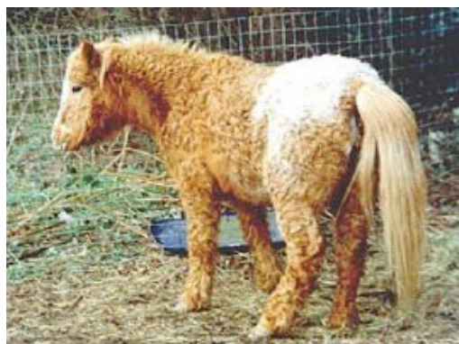
Delayed shedding of hair coat.

Horses and ponies with PPID will often develop a pot-belly appearance. You may notice other changes in body conformation. Common signs of PPID include formation of fat pads on top of the neck, tail head and above and around the eyes. Horses with PPID also tend to lose muscle.