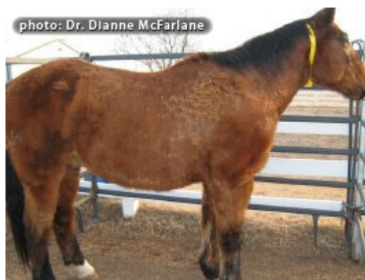
Horse with pot-belly.

Horses and ponies with PPID suffer an increase in cortisol levels. Excess cortisol is produced by the adrenal gland because the part of the brain that controls the adrenal gland (the pituitary gland) is not functioning properly. High cortisol levels increase blood sugar (glucose) levels and suppress the immune system. This hormonal disease often goes unnoticed as signs are slow to develop and are often mistaken as normal in the aging process. The disease typically occurs in older equids but has been diagnosed in horses and ponies as young as 10. While all ages, genders and breeds are susceptible to developing PPID, ponies and some breeds of horses (specifically Latin blooded horses such as Paso Finos, Peruvian Pasos, Spanish Mustangs, Arabs and Morgans) seem to develop PPID more frequently.